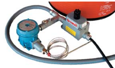
NEMA 7 Controller and High Temperature Limit Indicator Light