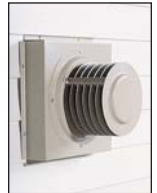
Shown: Vinyl Siding Vent Kit Accessory for Direct Vent Units