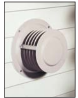
Shown: Standard Direct Vent Cap mounted on outside wall